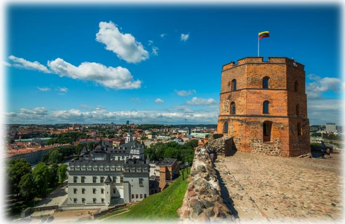
Vilnius, Photo by Laimonas Ciūnys